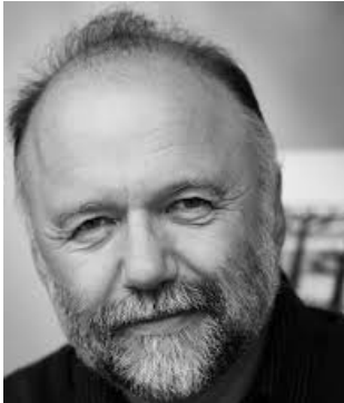
Andrey Kurkov , Ukraine novelist and independent thinker

Andrey Kurkov is the author of more than 20 books, numerous novels and scripts, including the bestseller Death and the Penguin . His works were translated into more than 37 languages.