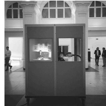
VREMEPLOV / TIME MACHINE