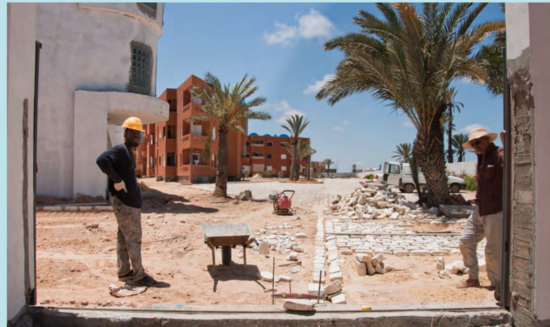
A migrant and his Tunisian employer are restoring a hotel in the South of Tunisia. Zarzis, Tunisia, June 2, 2020.

Refugees' and migrants' contributions to the Tunisian economy and its development often go unnoticed, since most engage in informal employment activities. Refugees and migrants are reported to fill gaps in several sectors by providing manpower and often working in physically demanding, largely low-skilled and informal jobs.